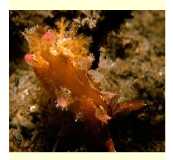
A Plocamoperus imperialis photographed at the Co-op, Port Stephens where it is common. Note the pink knobs.

From personal experience this species was a common sighting at Port Stephens (NSW Aust), especially at the Co-op.