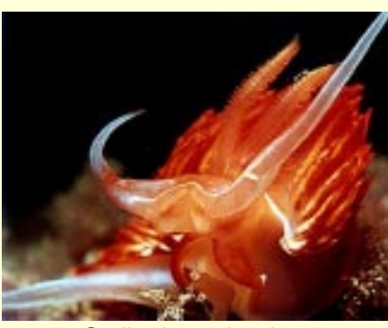
Godiva banyulensis