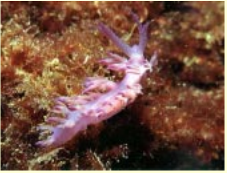
Flabellina affinis