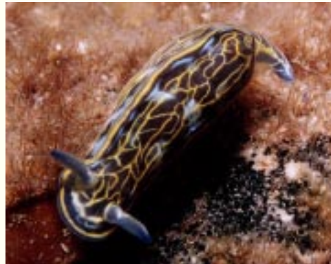
Fig.2 © 2000 Josep M a Dacosta