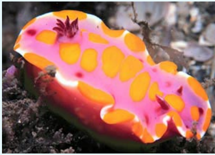
Ceratosoma amoena is common at most of the Port Stephens dive sites. It displays a wide variation from pale to bright pinks and yellows.