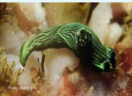
A small Tambja found regularly at Fly Point. Several Tambja species have been found at Port Stephens.