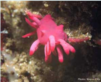
Hopkinsia sp is regularly found on the bryozoan in the deeper water at Halifax Park.