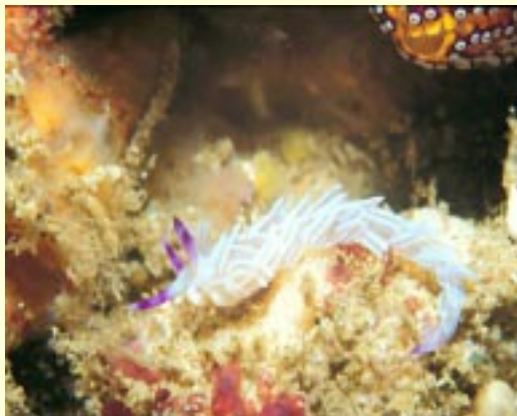
Pteraeolida ianthina (Angas 1864).

This species can be found throughout the tropical Indo-Pacific, usually in shallow water (2-10m) feeding on hydroids and possibly alcyonaneans.