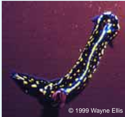
Fig.2 Hypselodoris obscura . There is some confusion with this and H. infucata .