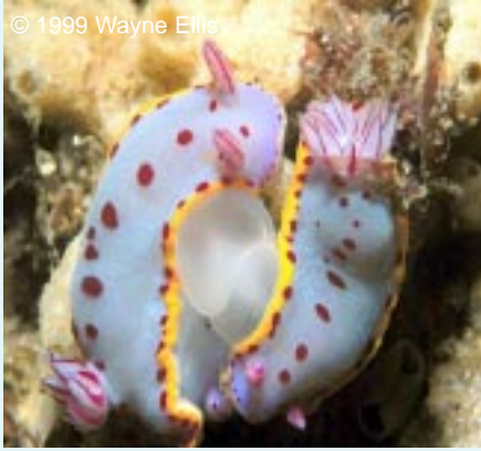
Fig.1 A pair of Hypselodoris bennetti mating