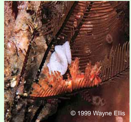
Fig. 1. Doto sp photographed at Lord Howe Island, NSW, Australia.

Copies of Neville's Coleman's "Nudibranch's of the South Pacific" are available for $15 Aust plus postage Email for details