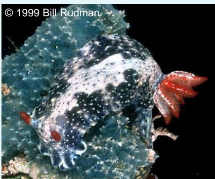
Fig.3 Hypselodoris saintvincentius known only from South Western Australia